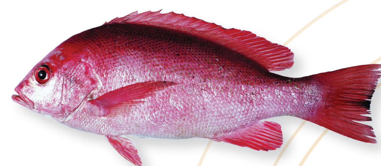
Crimson Snapper Lutjanus erythropterus (fish.gov.au)